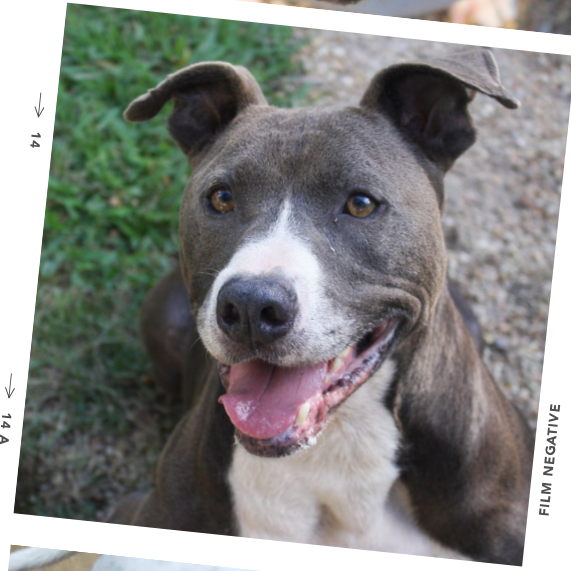
→ 14 → 14 A