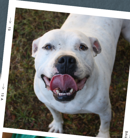
→ 13 → 13 A