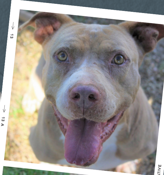
→ 13 → 13 A