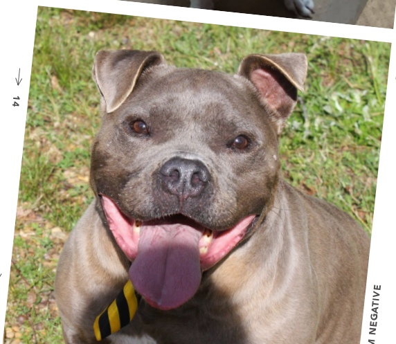
→ 14 → 14 A