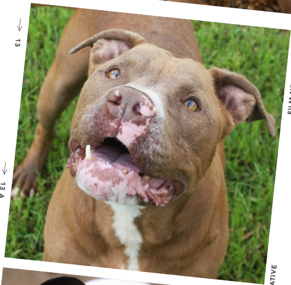
→ 13 → 13 A