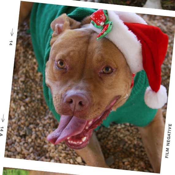
→ 14 → 14 A