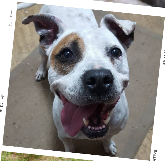
→ 13 → 13 A